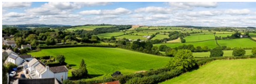
(3) Looking north from the church tower with Caradon and Kit Hill in the distance. (Click on image to enlarge)