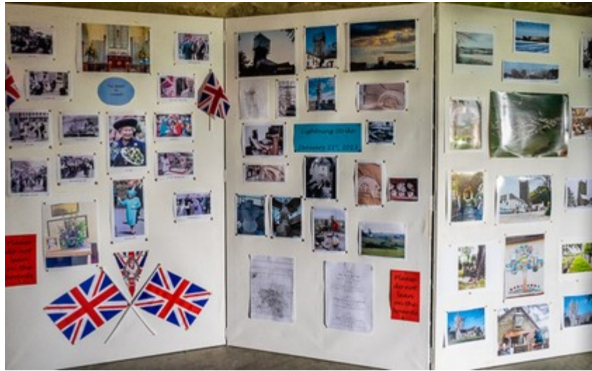
(1) One of the displays