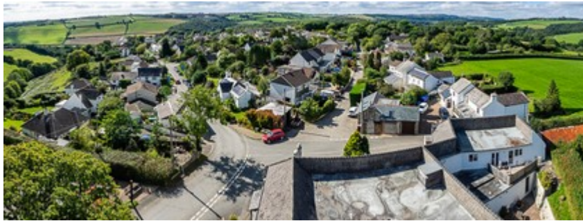
(6) To the west over the village with Caradon again in background right. (Click on image to enlarge)