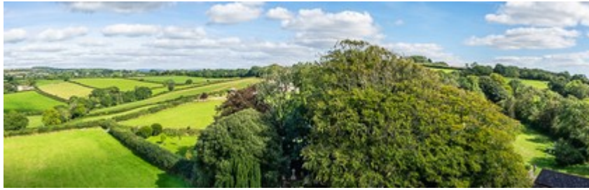
(4) East from Pillaton church tower with Dartmoor just visible on the horizon. (Click on image to enlarge)