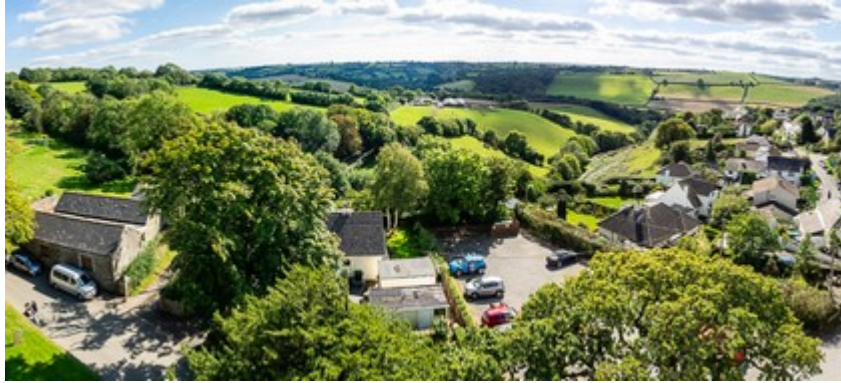
(5) The view south from Pillaton church tower. (Click on image to enlarge)