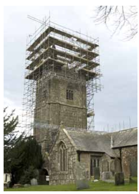
The church tower encased in scaffolding

The meeting also heard a great number of fund raising suggestions put forward that ranged from concerts, coffee mornings, quiz nights, Black Tie Ball to a sponsored half marathon and even an abseil down the church tower (once all building work is complete). Some of these activities have already become reality and are advertised elsewhere in the Village news and on the web site.