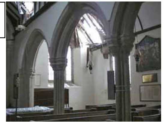
The largest of five holes in the church roof

The night of 21 January 2013 will not quickly be forgotten in Pillaton. Just after 11.00 pm lightning struck a field close to Blunts. Minutes later there was an enormous clap of thunder and a devastating bolt of lightning struck the church tower in Pillaton. The north eastern pinnacle on the tower was completely destroyed